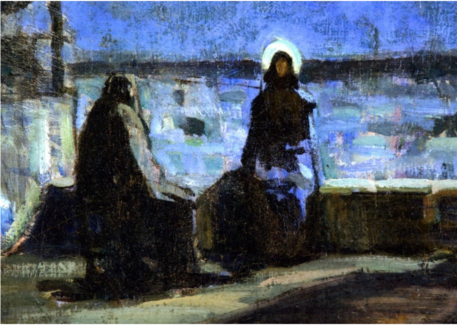
Study for Nicodemus Visiting Jesus, 1899 - Henry Ossawa Tanner